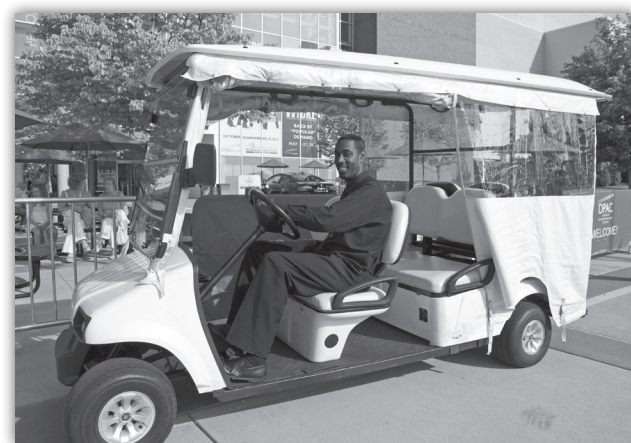
DPAC's Courtesy Shuttle from American Tobacco's North Deck