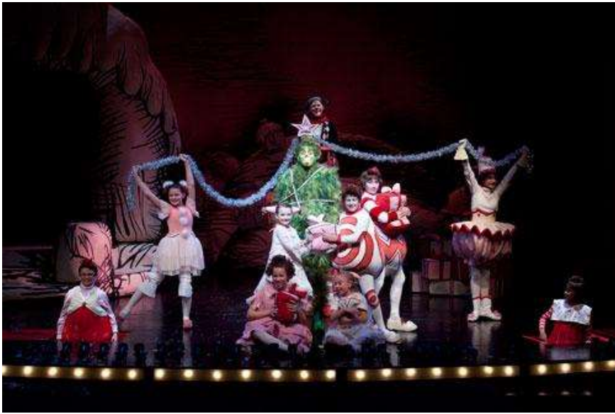
The Grinch gets tied up by Whos.