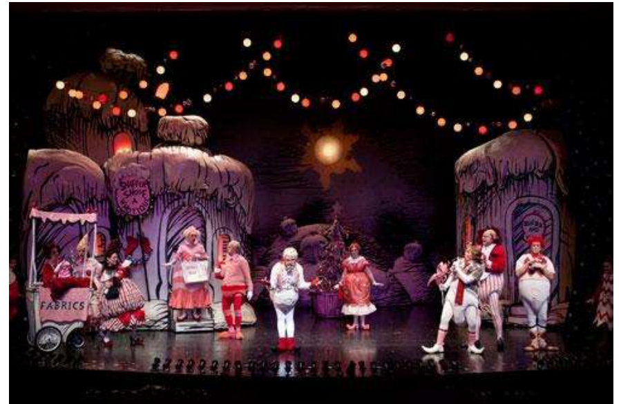
The Whos sing a song while shopping for presents.