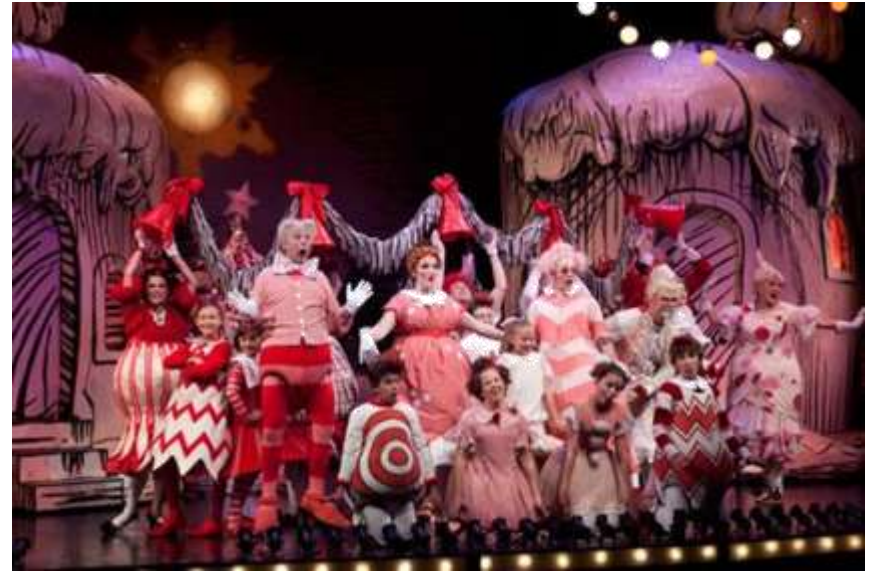
The Whos love to sing about Christmas.