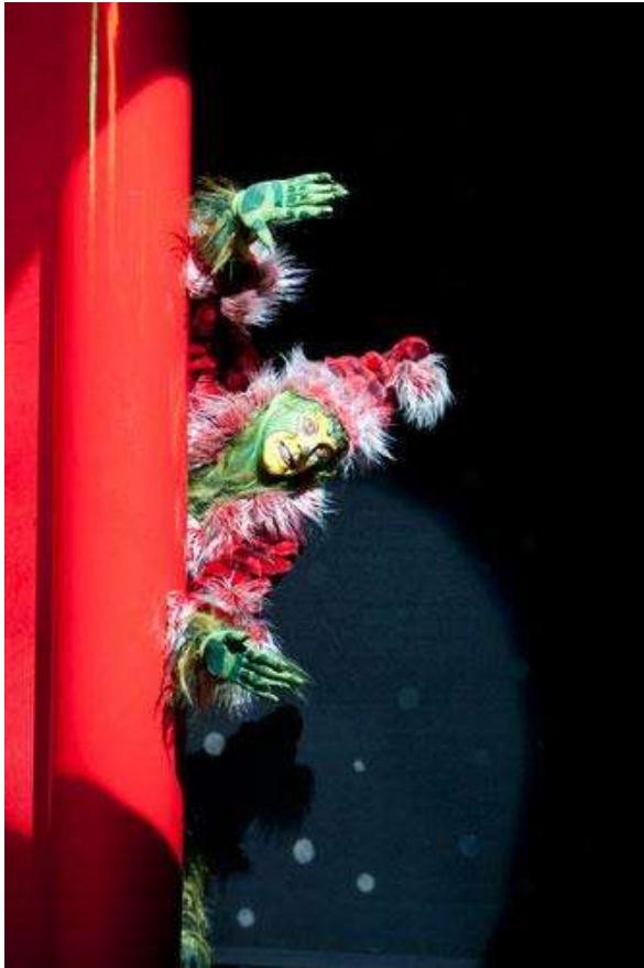
The Grinch surprises the audience.