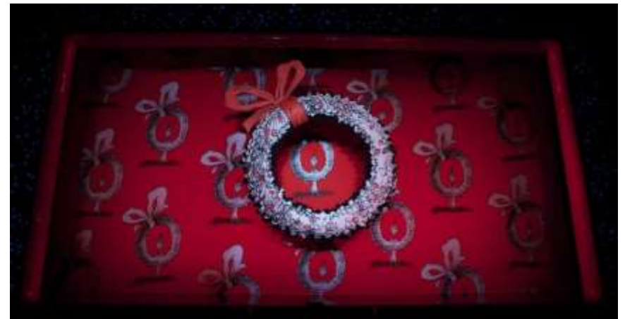
The stage. The curtain is bright red.