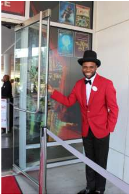
The entrance to DPAC.