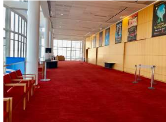
The theatre lobby.